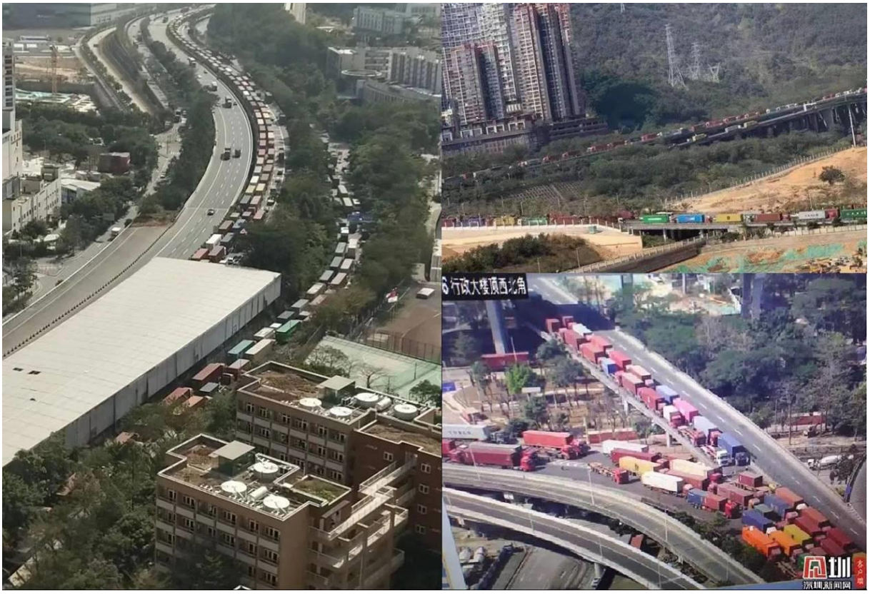
Congested access to the port

The stacking of heavy containers has reached the limit