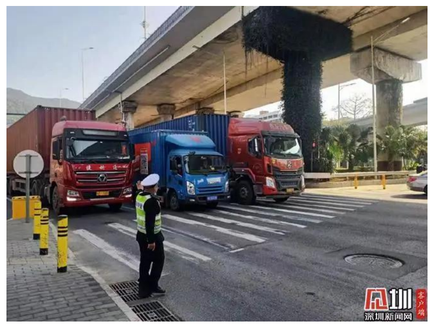
Relevant departments increase pavement inspections and diversion efforts

On February 4th, the Shugang Passage has implemented restrictions on traffic from east to east (gate B) and west to west (gate A). If it is not necessary, you should avoid Yanpai Expressway, Huiyan Expressway (Beishan Road and Mingzhu Road) and Yanba Expressway when you travel in the past year to avoid delaying your trip.